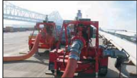
2xCD225m Bay Bridge

DRI-PRIME AND HIGH PRESSURE HYDRAULIC SUB PUMPS